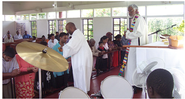
Sunday Service at Emanuel Lutheran Church