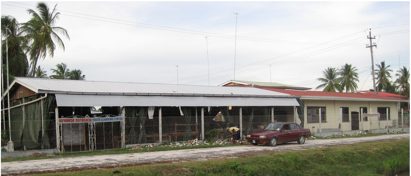
The Guyanese Outreach Youth Learning Centre

The Board and I wish you and your families a very blessed Christmas. May He multiply your blessings in the coming New Year.