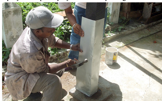
A creative solution - posts wrapped in aluminum