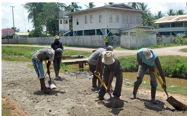
A crew fills holes to prepare for the concrete

We are grateful to the government and the village officers. They took care of the muddy road for us. We praise God for this favor.