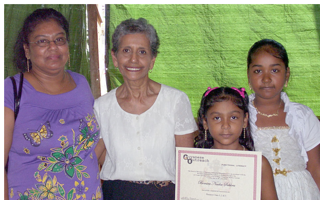
This mother was very grateful for GO's Literacy Program. Her daughter received first place in the government's reading program in her village at Crab-wood Creek.