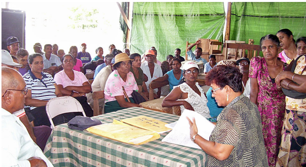
Senior citizens receiving their pension checks

Over 300 Senior Citizens gather under the Tent to collect their pension each month. As for now GO is known as the Christian organization that loves to accommodate them "in their old age." So often we bring our Lord Jesus through His love. The Rotarians also use the Tent to donate humanitarian aid.