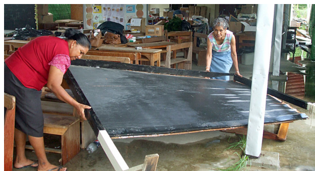
The blackboard had to be rebuilt by a carpenter