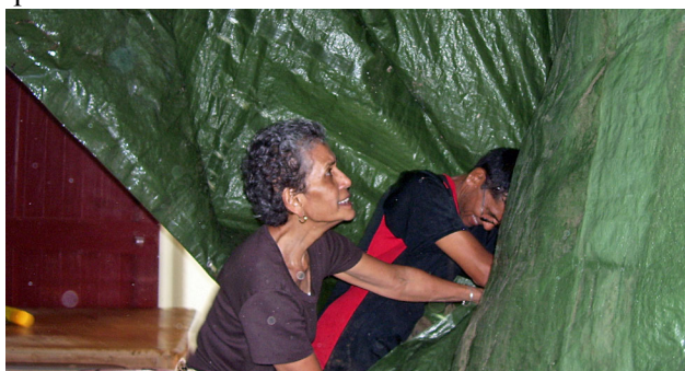
Holding the tarps together during the storm