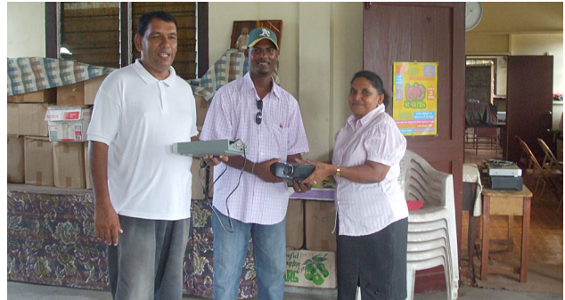
The projector is received for evangelism