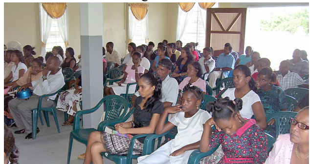
Sunday Service at Agape Church