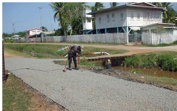
The finished road