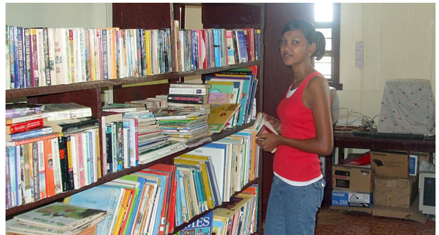
The Library serves the community

There was time also to mourn with those that mourn. A woman's husband died suddenly, and we waited for the hearse to stop by where she lived before the funeral service.