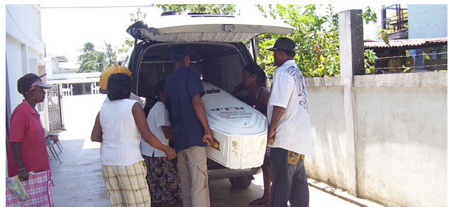
The hearse arrives with the casket

There was also time to rejoice. I attended the wedding of one of our part-time computer technicians. The delicious vegetarian food was served from freshly picked large leaves from the pond. No forks or spoons served.