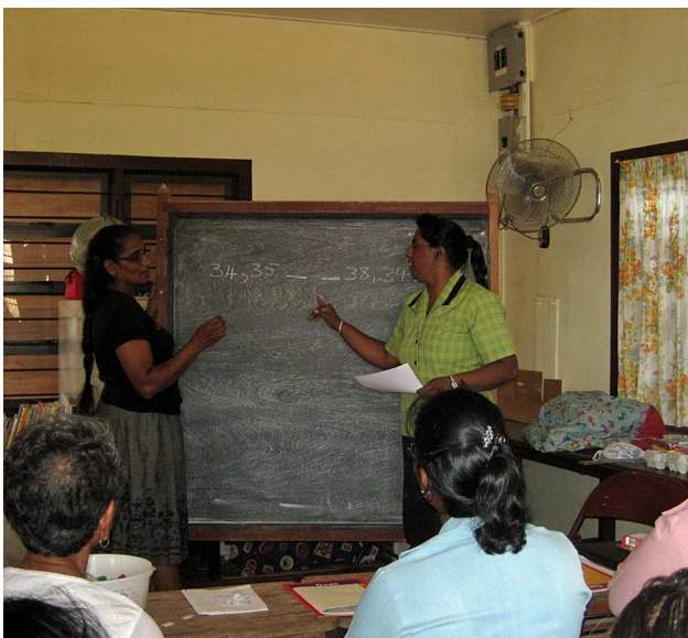
Two of GO's teachers demonstrated a lesson

GO implemented a new math program. Two teachers participated in a demonstration while the reading advisor followed through with the curriculum to make sure it was understood. GO continues to serve the community with computer, reading/math (in satellite locations) and craft classes, as well as a library.