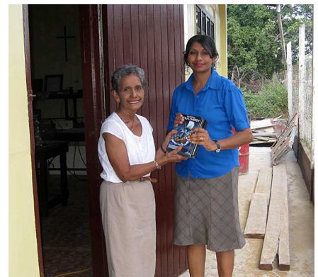
The Tagore High School Bible Club received the SOJ booklets