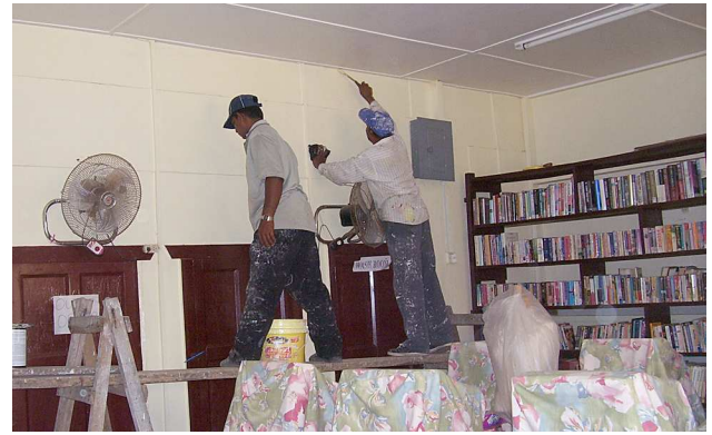
Painters give the inside a fresh look