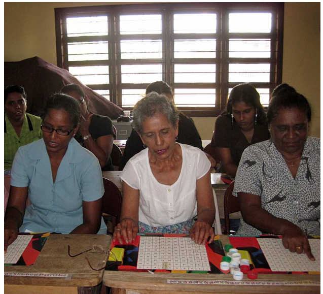
We followed along with the demonstration