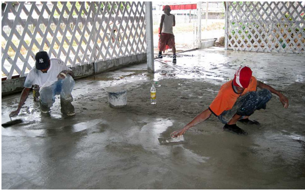
Carpenters smooth the new cement floor