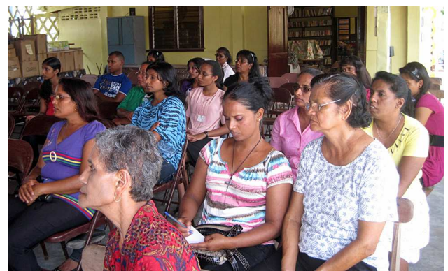
Local Pastors & Sunday School Teachers were eager to learn more about this new teaching tool