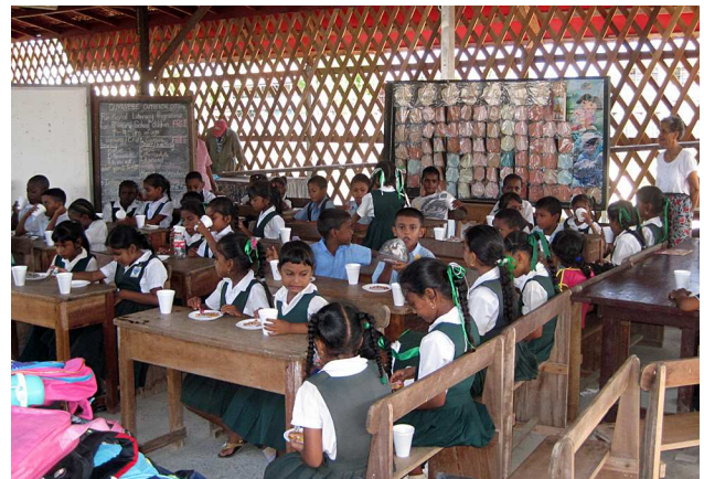
A children's party before the renovation begins

Guyanese Outreach • PO Box 48456 • Minneapolis, MN 55448