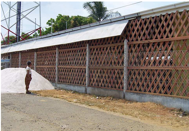
The lattice wall around the tent

The renovation started on October 1st. Before the concrete floor in the tent area was fixed, the children were able to enjoy a wonderful party due to the generosity of one of our reading program supporters. The following day, construction continued and concrete work started. Carpenters and painters worked simultaneously to complete the renovation in a month while I was there. In this newsletter, we'll let our pictures show the progress.